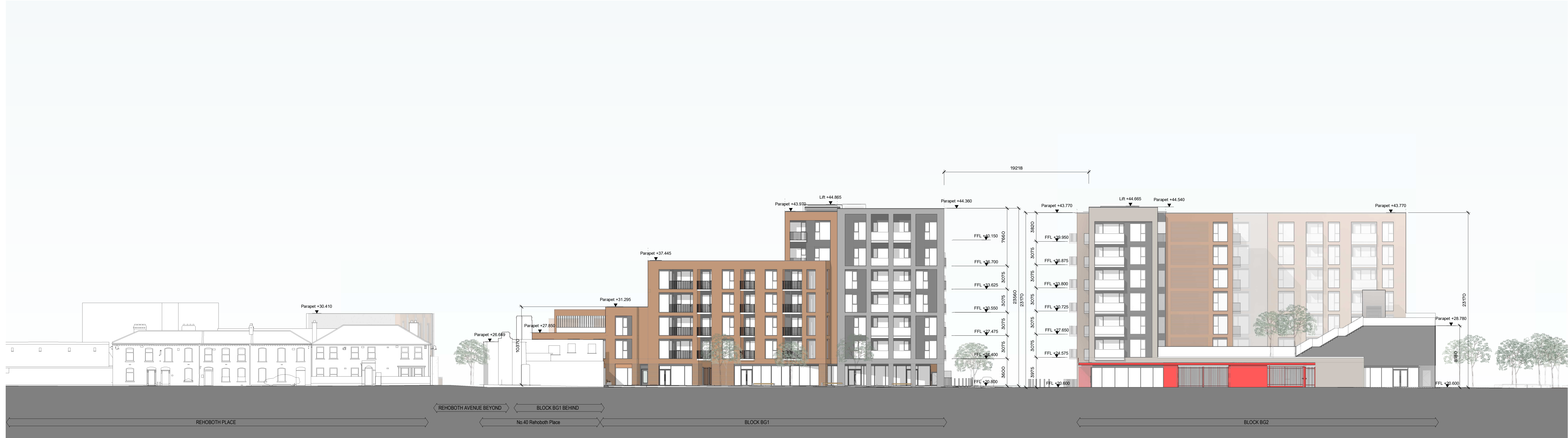
1 Contiguous Elevation 05 BG1-BG2 1 : 200