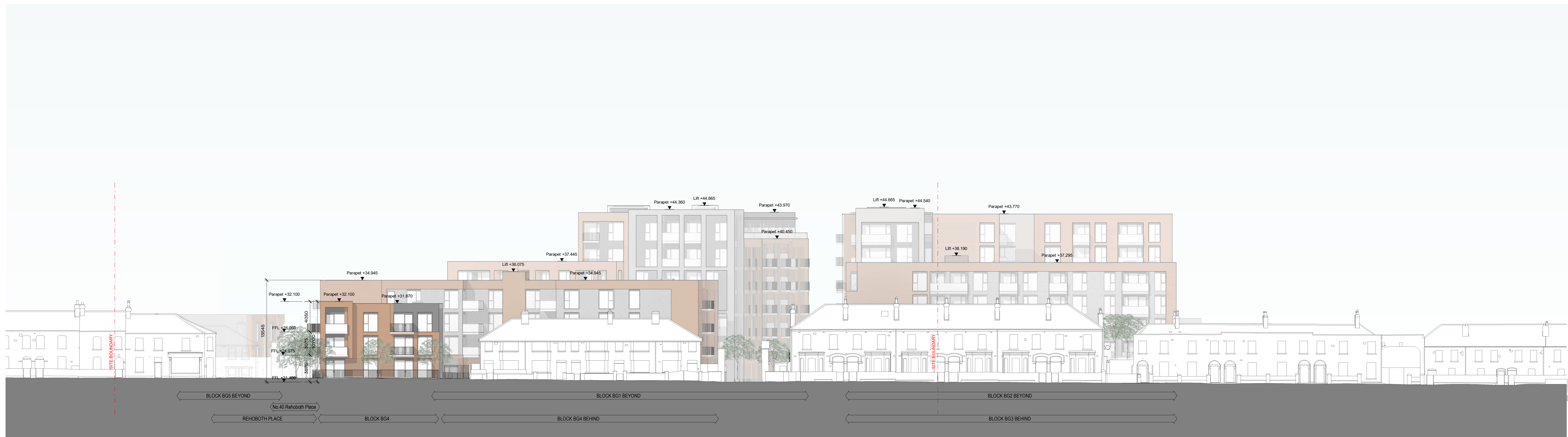
2 Contiguous Elevation 06 BG4-BG3 1 : 200